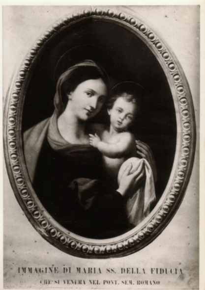
IMMAGINE DI MARIA SS. DELLA FIDUCIA CHE SE VENERA NEL PONT. SEM. ROMANO

it the Roman Major Seminary. Through it all, devotion to the image of Our Lady remained strong among the seminarians, who established a place of honor for her in a small chapel for theology students.